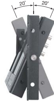
Adjustable View Angle for Rack