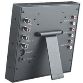
Hinge Stand as a Photo Frame